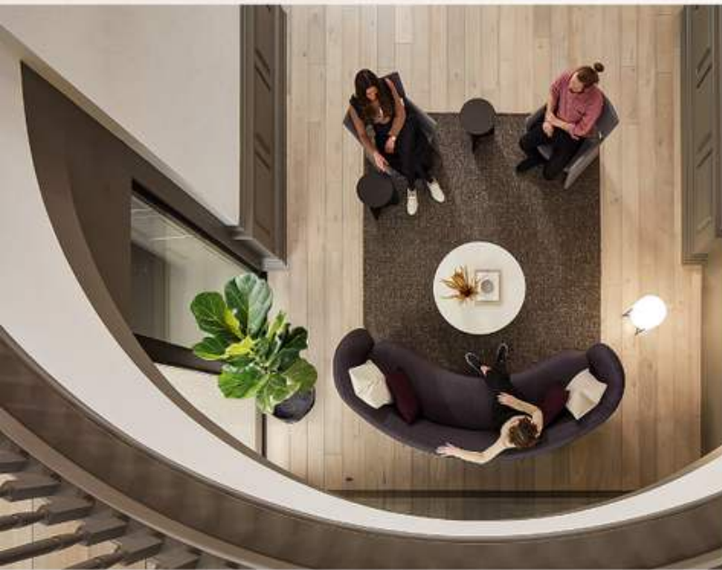
33 NORTH LASALLE STREET

EXPERIENCE THE CONVENIENCE AND ALLURE OF CHICAGO'S LASALLE STREET - THE INNOVATION CENTER OF YESTERDAY AND TOMORROW.